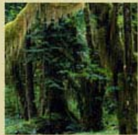
E N V I R O N M E N T