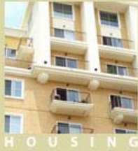
H O U S I N G