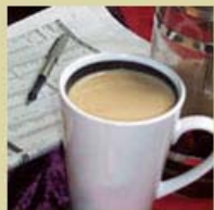
N E W S