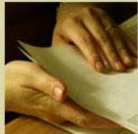
E D U C A T I O N